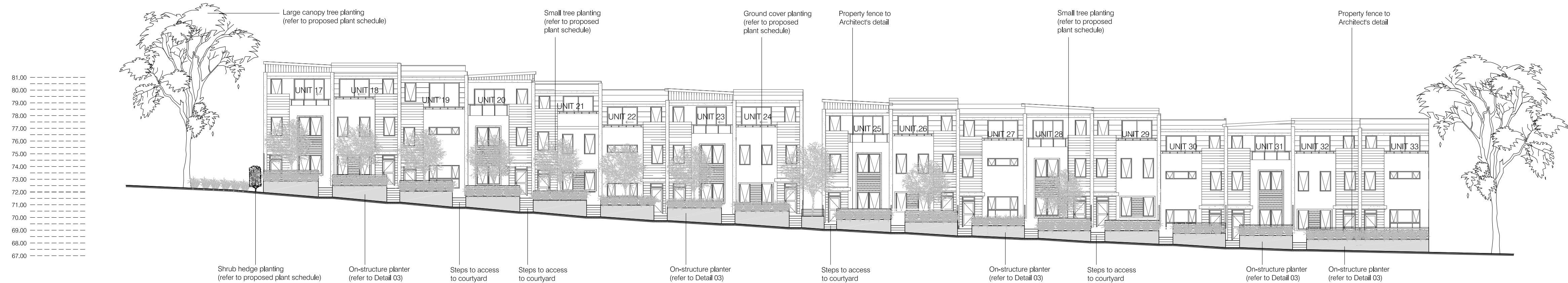
ELEVATION E-E scale: 1:200